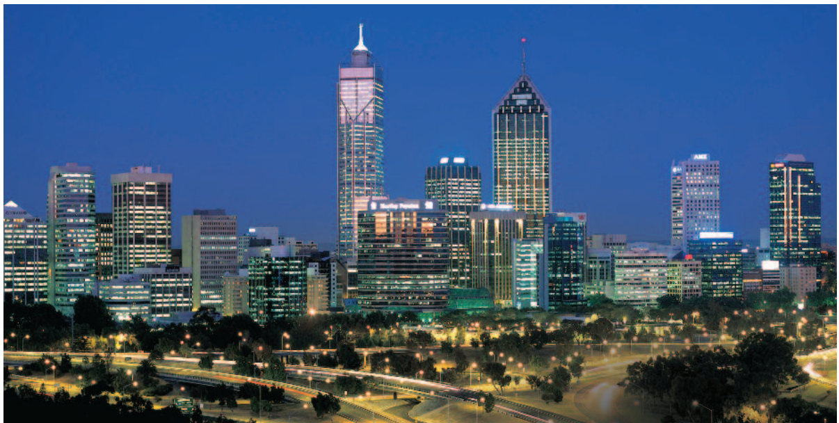
Perth at night

ConMed Linvatec Cook Australia Experien Gyrus ACMI InSight Oceania Olympus